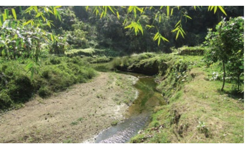
Govaniya Chhara of Mirsharai Upazila

Department as a requirement of the law of Bangladesh, which need to be complied. Hence, the implementation of the project depends on the approval from the Bangladesh Forest Department along with the conditions for adopting the management measures (i.e., habitat and vegetation compensation and construction of wildlife trails, etc.) suggested under this study.