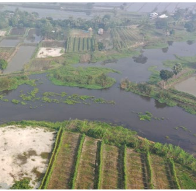
Integrated Water Resources Management Practices in the Study Area

The East Gopalganj project area will benefit from the proposed interventions for improving drainage, irrigation, navigability, salinity intrusion protection, and riverbank protection through proposed sustainable and environmentally friendly structures. This project would alleviate drainage congestion by increasing the irrigation and water-carrying capacity of khals. This will result in an increase of 56,000 MT crops and 227 MT fish in the national production.