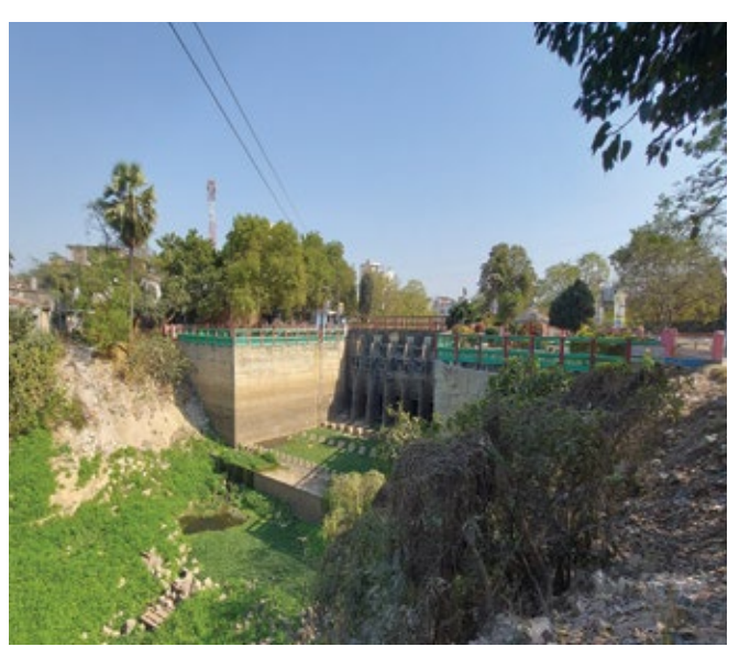
Non-functional Regulator at Rohanpur, Chapainawahganj

The dredging of the Padma River and the construction of crossbars will increase the river's flow during the dry season. This will lead to the enrichment of the riverine ecosystem and the flushing out of pollution in the Chapainawabganj, Rajshahi, and Natore districts. Crop production will also increase due to changes in cropping patterns and the introduction of high-yielding variety/hybrid crops in the erosion-protected lands. The bank protection work will also create new fish habitats for species like Rita, Baila, Baim, Chingri, Kalbaus, etc. In addition, the Mahananda and Ganges/Padma river-dependent area will see an increase in agro-based employment opportunities after land stability due to bank protection. Tourism-related livelihood would be created in the Padma River adjacent to the crossbar area. The study is expected to be completed by this year.