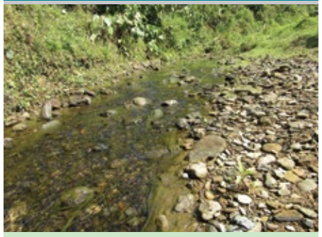
Khoia Chhara in Mirsharai Upazila, Chattogram