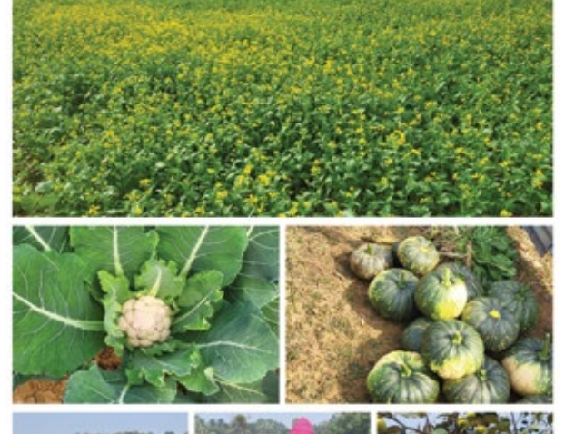
Utilization of CEGIS' proposed Lab and Training Center Land in Organic Farming practices

In response to these challenges, CEGIS is diligently working on establishing a cutting-edge training