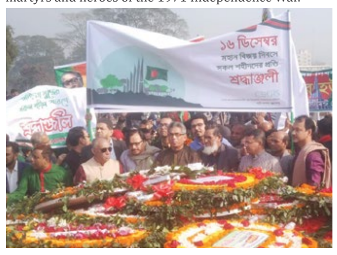
Executive Director and other professionals of CEGIS pay homage to liberation war martyrs in Savar

poignant gesture signifying deep reverence for the martyrs and heroes of the 1971 Independence War.