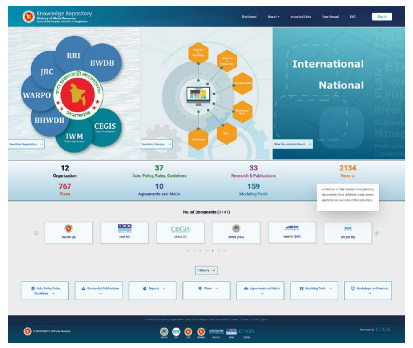
Homepage of the Knowledge Repository with Water Sector Related Information of Bangladesh

information in a summarized form based on the associated organizations and data categories. A significant number of data categories are available in the system like Acts, Policy, Rules, Guidelines, Agreements and MoUs, Reports, Plans, Modeling Tools etc. The knowledge information has been organized as the public, restricted and limited type access categories. The public type of documents will be visible to all type of users but the restricted and limited type of documents will be visible only to the authorized users. There are three type of data searching facilities in the system to facilitate users to get knowledge information very quick, smooth and efficiently. A data download option is available in the system so that any user can have a local copy of the document of interest. A data entry module, an admin module and an authorization and authentication are also available in the system. The knowledge repository is a national level platform and will support the decision making process of Bangladesh Government especially for the water sector.