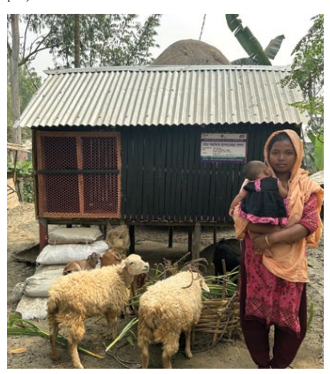
Slatted house of Goat rearing in Jamalpur

Center for Environmental and Geographic Information Services (CEGIS), a center of excellence, has been entrusted with auditing the Extended Community Climate Change-Flood Project (ECCCP-Flood). This auditing has evaluated the effectiveness of the Environmental and Social Management System of the ECCCP-Flood project against the targeted objectives. Besides, this study has suggested a Corrective Action Plan (CAP) on the non-compliance issues to ensure better project outcomes and successful implementation of the project activities.