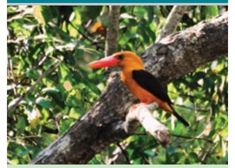
Brown Winged Kingfisher