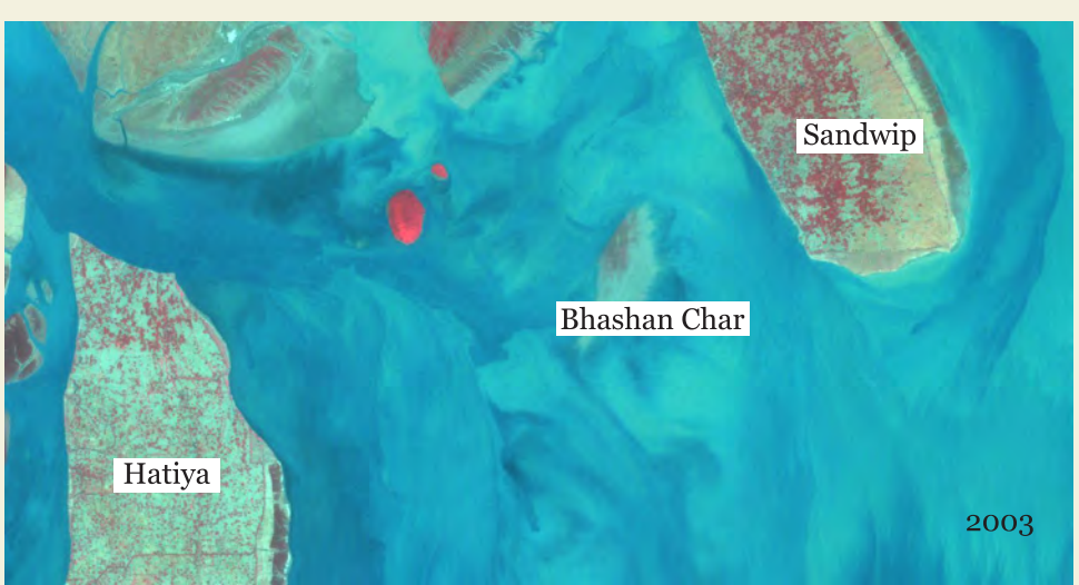
Bhashan Char in Historical Satellite Images