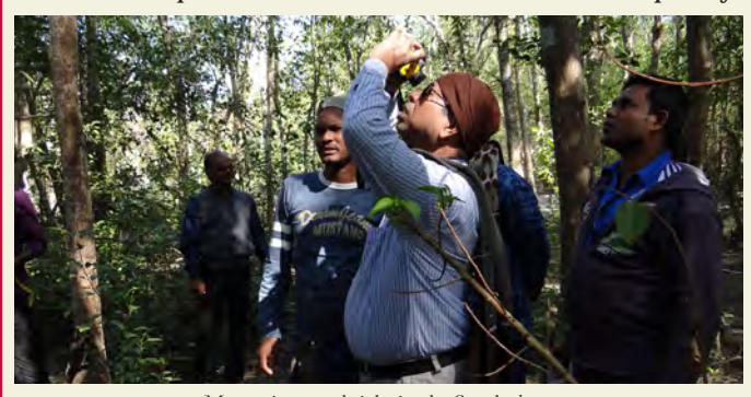
Measuring tree height in the Sundarbans

However, as per EMP approved by DoE and being the Environmental Monitoring Consultant of the Project, CEGIS has been monitoring various environmental and social parameters such as ambient air quality,